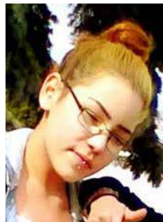
caller will remain anonymous.

8477 (TIPS), by internet at www.tipsubmit.com , or by SMS ( www.crimestoppers.ab.ca for instructions). You do not have to reveal your identity to Crime Stoppers, and if you provide information to Crime Stoppers that leads to an arrest, the recovery of stolen property, and/or the seizure of illicit drugs, you may be eligible for a cash reward. Crime Stoppers does not subscribe to call display and the identity of the