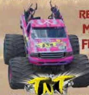
MONSTER RIDE TRUCK