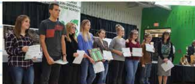
Grade 9 Honours Students