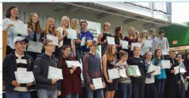
Grade 8 Honours Students

was Friday, October 14, 2016 It was our First Awards Night in the New School!