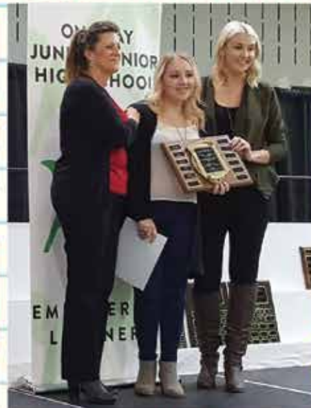
Grade 12 Citizenship Awards