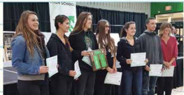
Grade 11 Honours Students