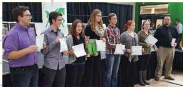
Grade 10 Honours Students