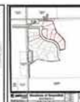
MEADOWS OF ROSENTHAL