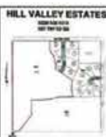
HILL VALLEY ESTATES