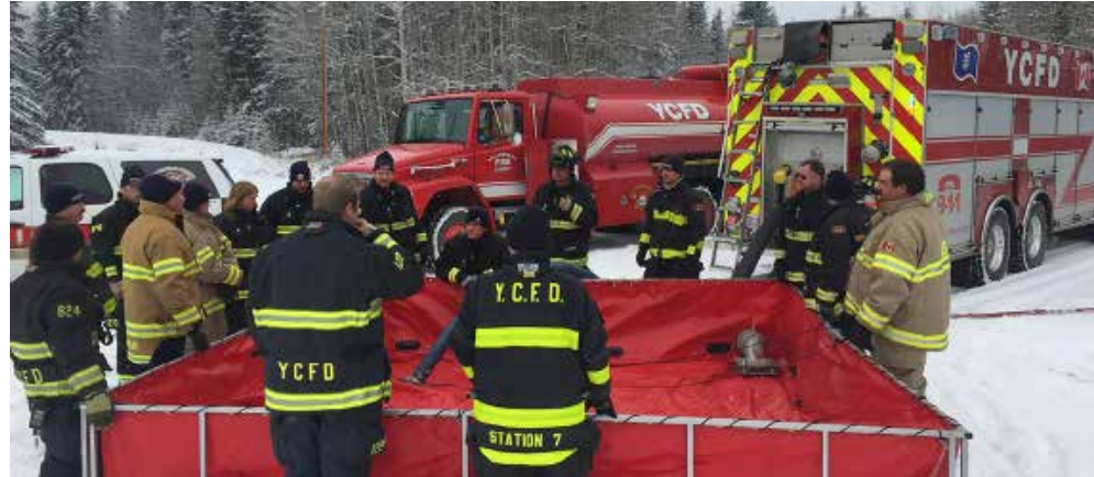
Continued on Page 8