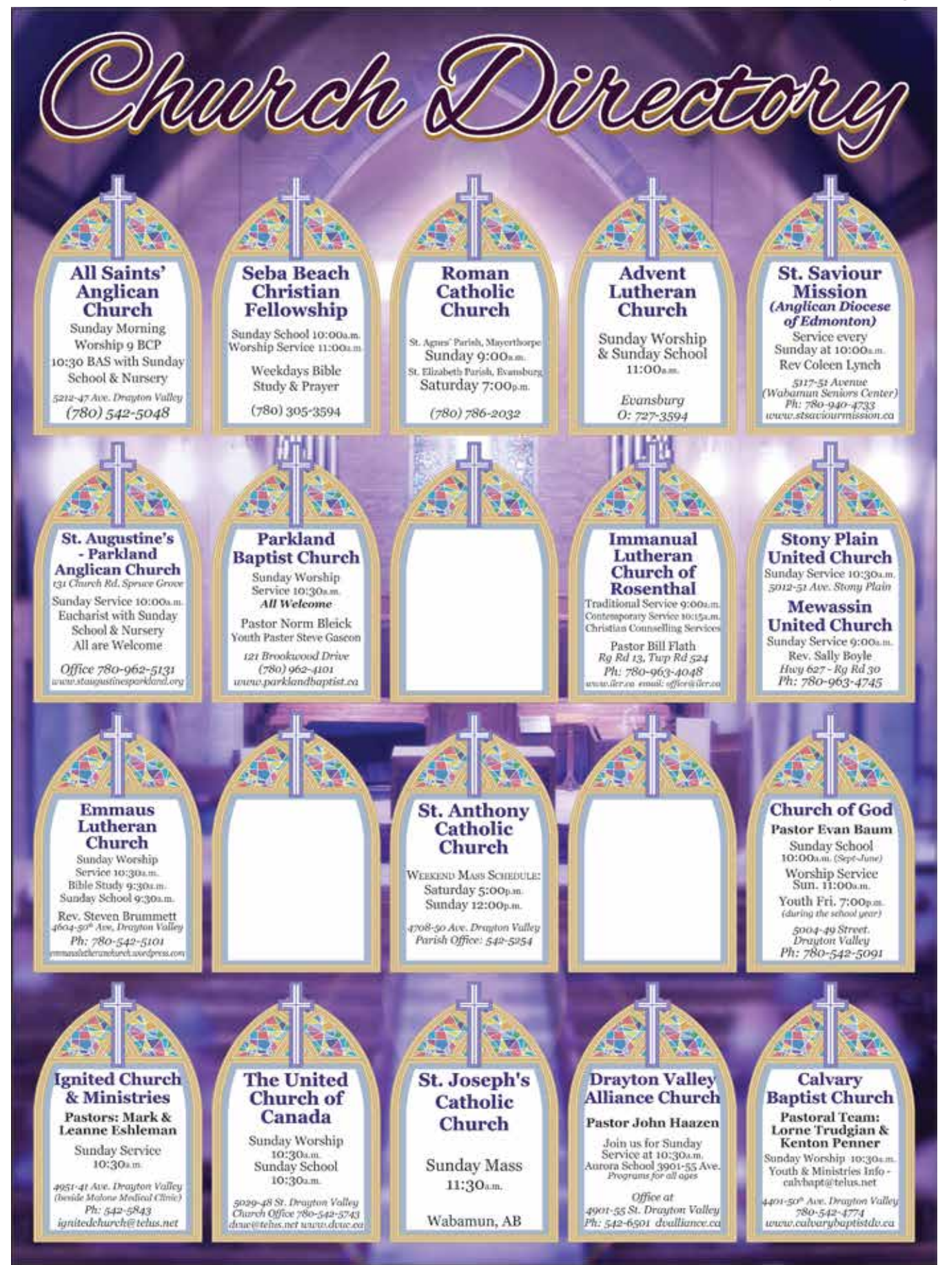
November 1, 2016