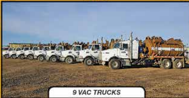
9 VAC TRUCKS