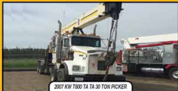
2007 KW T800 TA 30 TON PICKER

THURSDAY DECEMBER 15 TH , 2016 @ 9:00 A.M. • EDMONTON, AB, CANADA