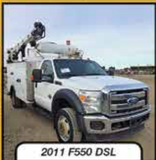
2011 F550 DSL