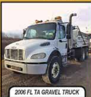
2006 FL TA GRAVEL TRUCK