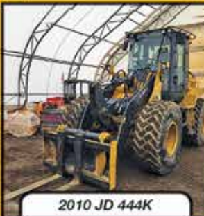
2010 JD 444K