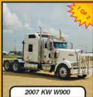
2007 KW W900