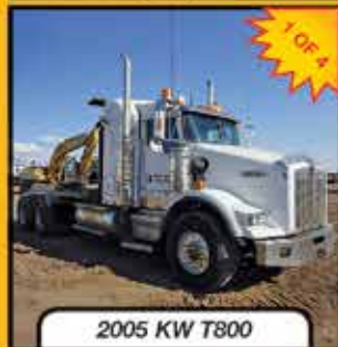
2005 KW T800