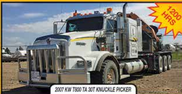
2007 KW T800 TA 30T KNUCKLE PICKER