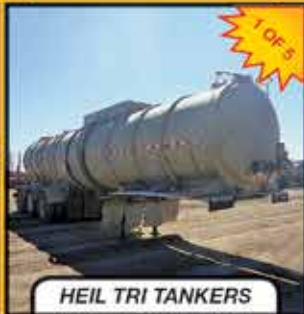
HEIL TRI TANKERS