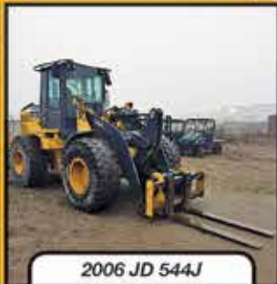
2006 JD 544J