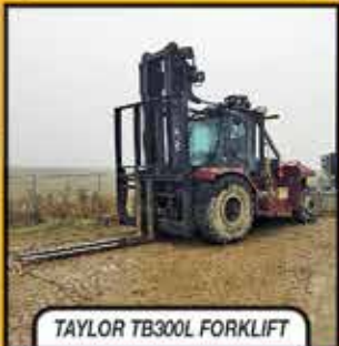
TAYLOR TB300L FORKLIFT