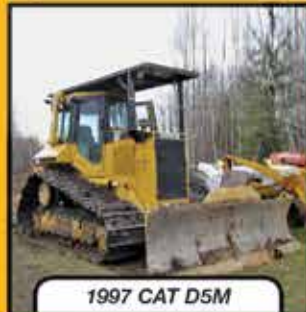
1997 CAT D5M