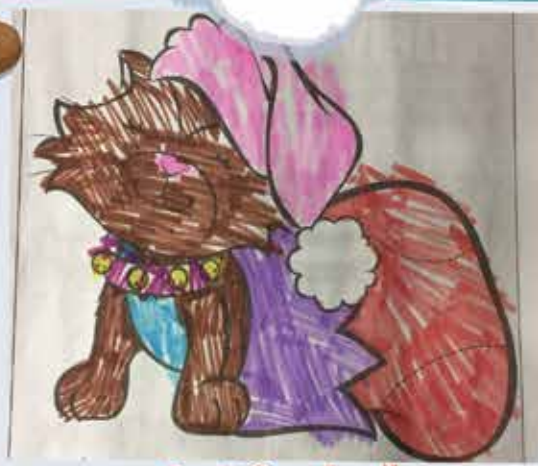
April B. Age 4