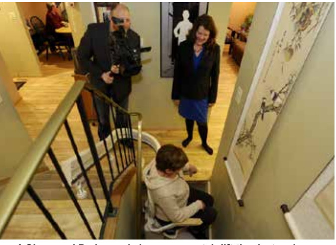
A Sherwood Park couple have a new stair lift thanks to a home equity loan under the Seniors Home Adaptation and Repair program.