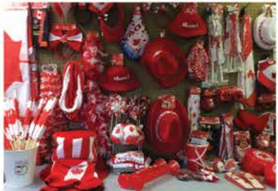
THESE CANADA DAY ITEMS ARE AVAILABLE FOR PURCHASE AT THE VILLAGE OFFICE

Join us for a BBQ from 11:00AM-7:00PM in front of the Village Office Presented by The Village Of Alberta Beach and The Alberta Beach Chamber Of Commerce