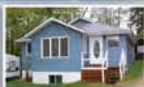
SOLD LISTING 129 - 5TH STREET