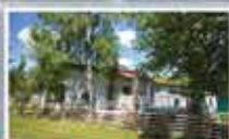
LISTED & SOLD 211 - 2 STREET