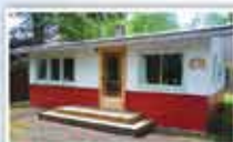
LISTED & SOLD 727 - 7 STREET