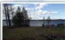
LISTED & SOLD 9 ASPEN AVE