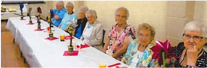
Submitted by Onoway Golden Age Club

June 4 – 11, 2017 was Senior’s Week in Alberta. Each year we plan a banquet for our June Supper. This year’s banquet was held June 6 at the Onoway Community Hall. “Grandma B” catering from Calahoo prepared an excellent supper.