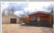
LISTED & SOLD 22 COTTONWOOD