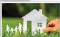
LISTED & PENDING # 89 LAKE VIEW