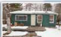
SOLD LISTING 523 - 5TH STREET