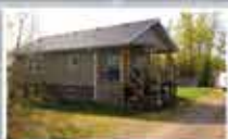
SOLD LISTING #13 - 53002 - RR 54