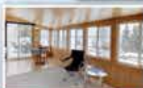
SOLD LISTING 230 OSCAR