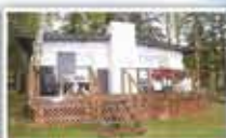
LISTED & SOLD #64 - 523 24