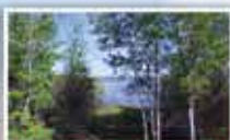
LISTED & SOLD #26 - 4615 LAKESHORE