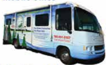
Air Conditioner & Bathroom