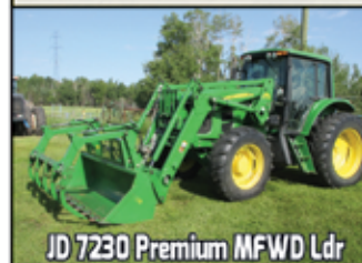
JD 7230 Premium MFWD Ldr

Open House: Mon Aug 28 4 - 7 pm or call 780-898-0729 for arrangement to view.