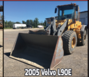
2005 Volvo L90E