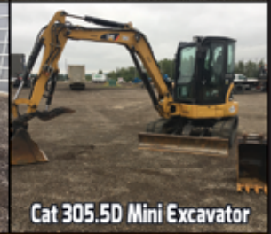
Cat 305.5D Mini Excavator