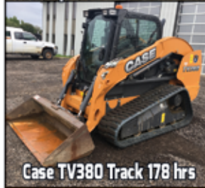
Case TV380 Track 178 hrs