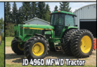
JD 4960 MFWD Tractor

TEAM AUCTIONS Sekura Auctions Since 1966