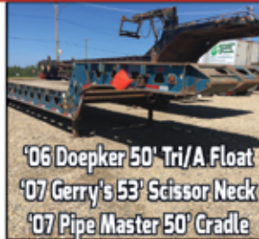
'06 Doepker 50' Tri/A Float '07 Gerry's 53' Scissor Neck '07 Pipe Master 50' Cradle

2006 ACV 10 X 26' Tri/A Wellsite Trailer • 2007 Load King 48' Tri/A Step Deck Trailer • 2007 Gerry 53' Tri/A Scissor Neck Trailer • 2003 Load King 53' High Boy Trailer • 2006 Doepker 50' Oilfield Float • 2003 32' & 28' Super B Flat Deck • 2007 Pipe Master 50 ft Tank T/A Cradle Trailer • Steel Deck • 15' Gravel Box (unused)