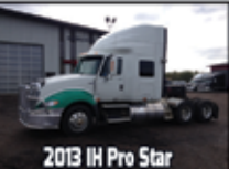
2013 IH Pro Star

Moore's Agri-Trade 780-388-3759 '12 McCormick CT55U MFWD Ldr Tractor - MF 2745 2WD - '14 CaseIH MFWD Ldr Tractor (new) - '16 Woods 72" Box Scraper - 2011 MF 1643 MFWD Ldr Tractor - NH TX68 Combine - Snow Blade - 84" Loader Bucket - '52 Oliver 77 Tractor - '02 Hyundai 730 Wheel Loader - Dozer Blades - '06 10x26 Wellsite Trailer - '86 Komatsu WA350 Loader - Tampo Packer - Cat Mini Excavator - Case 465 Skid Steer - Clark 666D Skidder - All New Cement Mixer Parts - '13 IH Pro Star Only 455,000 km - '12 Kenworth T-800 - '97 B Line Tri-Axle 6-10 Wide Log Bunks - '05 IH 9400I T/A Tank Truck - '14 Peterbuilt 378 Tri Drive Sleeper Tractor - '14 Kenworth T-800 Tri Drive Winch Truck - '11 Kenworth T-800 Extended Cab T/A Roll Deck Truck - '06 K-Line 50 Ton Tri-Axle Low Bed Trailer - Numerous Trailers - (2) 53' Insulated Reefer Trailers - (3) 53' Dry Van - (3) 20' Sea Cans and much more!