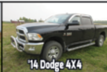
'14 Dodge 4X4