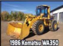
1986 Komatsu WA350