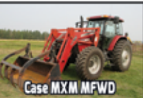
Case MXM MFWD

Case MXM 140 MFWD Loader Tractor - Bale Fork - JD 330LC Excavator - JD 7720 Combine - CaseIH 8220 25' PT Swather - NH 1090 18' Swather - Westfield 606-26' Grain Auger - (2) Allied 7x35' Augers - JD 9350 20' Hoe Press Drill - Ezee-On 12' Disc - JD 16' Cultivator - 25' Morris Rod Weeder - '95 Volvo T/A Potable Water Truck - '87 T/A Gravel Truck - '14 Dodge 3500 SLT 4X4 Mega Cab - '00 F150 Ext Cab 2WD - '95 Chrysler Intrepid - '99 24 ft G/N T/A Horse Trailer - '01 30' G/N T/A Dually Deck Trailer - 07 Yamaha 660 Rhino Side X Side - Hyundai HHD 6250 Generator and much more!