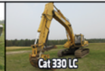
Cat 330 LC

TEAM AUCTIONS Sekura Auctions Since 1966