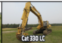
Cat 330 LC

TEAM AUCTIONS Sekura Auctions Since 1966