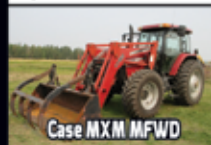
Case MXM MFWD

Case MXM 140 MFWD Loader Tractor • Bale Fork • JD 330LC Excavator • JD 7720 Combine • CaseIH 8220 25' PT Swather • NH 1090 18' Swather • Westfield 606-26" Grain Auger • (2) Allied 7x35" Augers • JD 9350 20' Hoe Press Drill • Ezee-On 12' Disc • JD 16" Cultivator • 25' Morris Rod Weeder • '95 Volvo T/A Potable Water Truck • '87 T/A Gravel Truck • '14 Dodge 3500 SLT 4X4 Mega Cab • '00 F150 Ext Cab 2WD • '95 Chrysler Intrepid • '99 24 ft G/N T/A Horse Trailer • '01 30' G/N T/A Dually Deck Trailer • 07 Yamaha 660 Rhino Side X Side • Hyundai HHD 6250 Generator and much more!