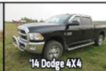
'14 Dodge 4X4