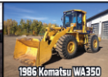
1986 Komatsu WA350