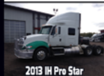
2013 IH Pro Star

'12 McCormick CT55U MFWD Ldr Tractor • MF 2745 2WD • '14 CaseIH MFWD Ldr Tractor (new) • '16 Woods 72" Box Scraper • 2011 MF 1643 MFWD Ldr Tractor • NH TX68 Combine • Snow Blade • 84" Loader Bucket • '52 Oliver 77 Tractor • '02 Hyundai 730 Wheel Loader • Dozer Blades • '06 10x26 Wellsite Trailer • '86 Komatsu WA350 Loader • Tampo Packer • Cat Mini Excavator • Case 465 Skid Steer • Clark 666D Skidder • All New Cement Mixer Parts • '13 IH Pro Star Only 455,000 km • '12 Kenworth T-800 • '97 B Line Tri-Axle 6-10 Wide Log Bunks • '05 IH 9400I T/A Tank Truck • '14 Peterbuilt 378 Tri Drive Sleeper Tractor • '14 Kenworth T-800 Tri Drive Winch Truck • '11 Kenworth T-800 Extended Cab T/A Roll Deck Truck • '06 K-Line 50 Ton Tri-Axle Low Bed Trailer • Numerous Trailers • (2) 53' Insulated Reefer Trailers • (3) 53' Dry Van • (3) 20' Sea Cans and much more!