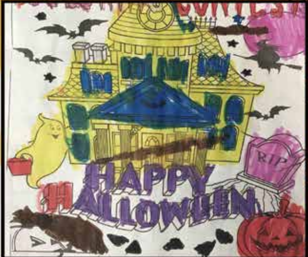
Brielle P. Age 5