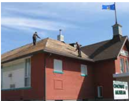
Re-shingling of the roof on the Onoway Museum (originally Beaupré School built in 1921)