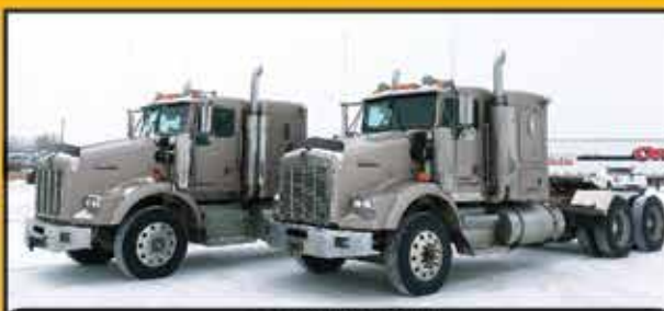
2 - 2006 KW T800