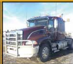
2014 MACK CXU613