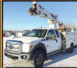
2013 FORD F550 DRW 4X4 BUCKET