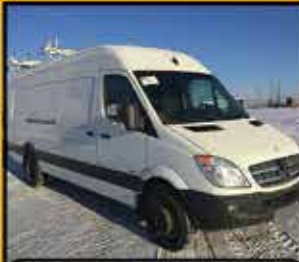
2012 MERCEDES BENZ SPRINTER