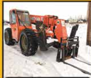
2008 SKYTRACK TELEHANDLER