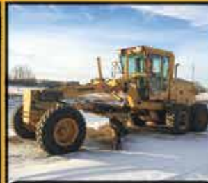
CHAMPION 730 MOTOR GRADER