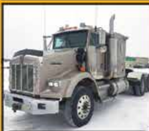
2001 KW T800B