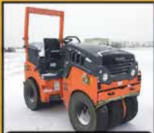
2016 HAMM HD14 TT PACKER