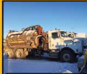
2004 KENWORTH T800 WET VAC DIESEL