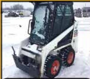
2014 BOBCAT S70