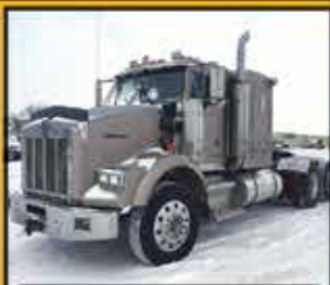
2002 KW T800B