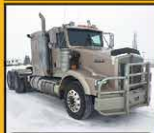
2005 KW T800B