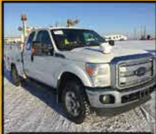
2012 FORD F350 4X4