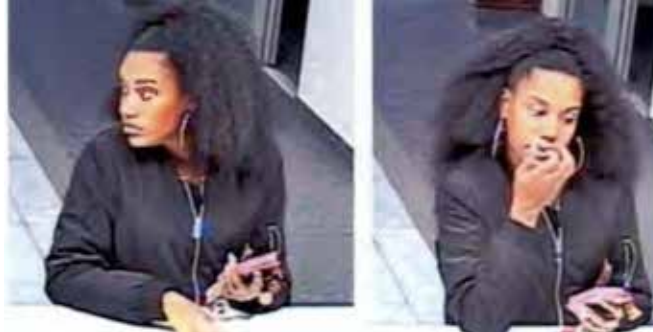
Submitted by St Albert RCMP File: 2018 - 67792 St. Albert, AB - As part of the

“K” Division RCMP Crime Reduction Strategy, which is a dynamic, provincially coordinated crime reduction program, St. Albert RCMP would like to advise that a female fraud artist has been seen in this city. St. Albert RCMP has shared intelligence with our law enforcement and government partners in Alberta, and have identified that the woman that cashed an altered Revenue Canada cheque in St. Albert, has also committed this same crime in other parts of the Province.