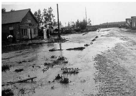
1949 – The Year of The Flood in Onoway