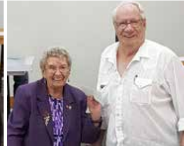
4TH PLACE WINNERS

The jackpot was not won this time and will be carried forward to our next tournament. This can be won by getting a 29 point hand or a 28 if a 29 is not achieved in that day.