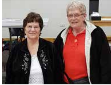
3RD PLACE WINNERS