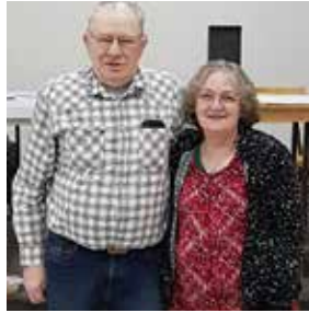
2ND PLACE WINNERS

We had such beautiful weather on this day that 62 teams came out to enjoy 12 games of cards at our tournament. We understand that an important part of the tournament for our players is to en-