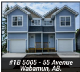
#1B 5005 - 55 Avenue Wabamun, AB.

3 bedrooms. Balconies with Lake View. Open concept kitchen, ensuite in master bedroom, kitchen with granite countertop, Stainless Steel Appliances, Hardwood floor. Washer & Dryer in Upper Level. 1,400 Sq. ft. Built in 2017, Gas Fireplace, New Home Warranty Program. Only 2 1/2 blocks from Lake & Marina Interested? Only $299,000.00