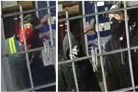
Submitted by Breton RCMP

Breton, Alberta - In the early morning hours of March 24 2018 the Breton RCMP were notified of a break and enter to the Breton ESSO. Upon review of video footage, it was noted that a newer white GMC or Chevrolet Crew Cab pickup truck had