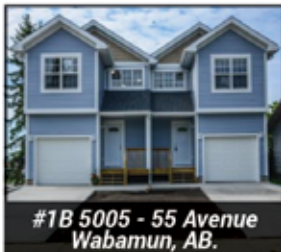
#1B 5005 - 55 Avenue Wabamun, AB.

3 bedrooms. Balconies with Lake View. Open concept kitchen, ensuite in master bedroom, kitchen with granite countertop, Stainless Steel Appliances, Hardwood floor. Washer & Dryer in Upper Level. 1,400 Sq. ft. Built in 2017, Gas Fireplace, New Home Warranty Program. Only 2 1/2 blocks from Lake & Marina