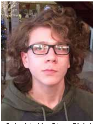
Submitted by Stony Plain/ Spruce Grove/Enoch RCMP