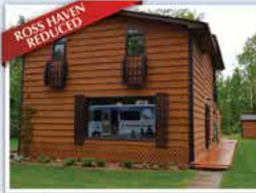
ROSS HAVEN REDUCED