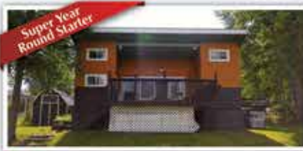
Super Year Round Starter