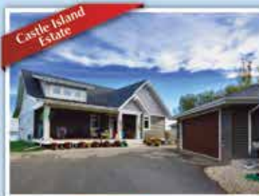
Castle Island Estate