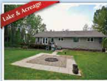
Lake & Acreage