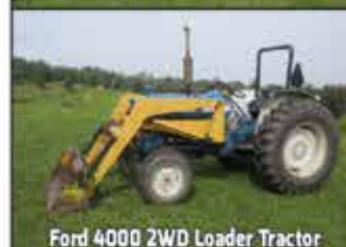
Ford 4000 2WD Loader Tractor