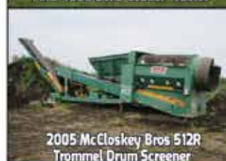
2005 McCloskey Bros 512R Trommel Drum Screener