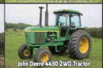
John Deere 4430 2WD Tractor