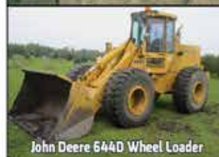
John Deere 644D Wheel Loader