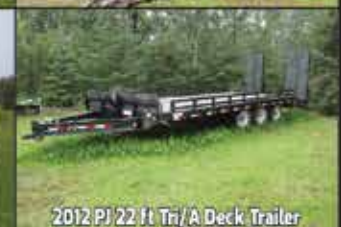
2012 PJ 22 ft Tri/A Deck Trailer