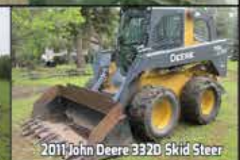
2011 John Deere 332D Skid Steer