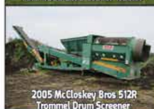
2005 McCloskey Bros 512R Trommel Drum Screener