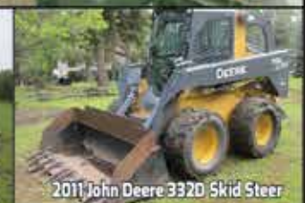
2011 John Deere 332D Skid Steer