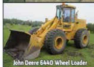
John Deere 644D Wheel Loader