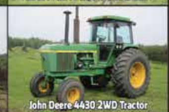
John Deere 4430 2WD Tractor