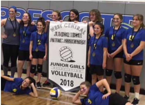
Submitted by Les Worthington | Wabamun School