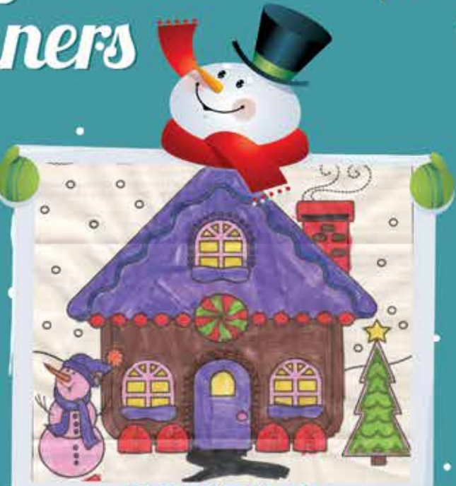
Astrid K. Age 5