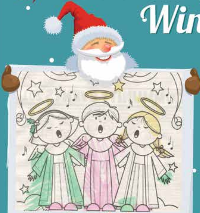
Devin Age 4