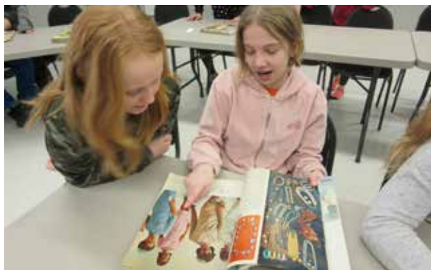
Pink was fashionable then and it still is now!