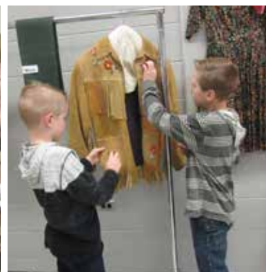
"I love that jacket!" was one response when asked which garment of those shown he liked best.