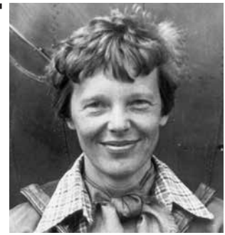
- Amelia Earhart

"Some of us have great runways already built for us. If you have one, take off! But if you don't have one, realize it is your responsibility to grab a shovel and build one for yourself and for those who will follow after you."