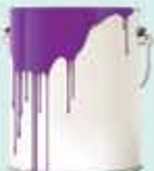
PAINT, EMPTY PAINT CANS