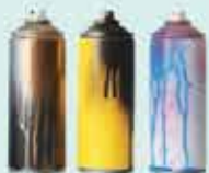
SPRAY PAINT CANS