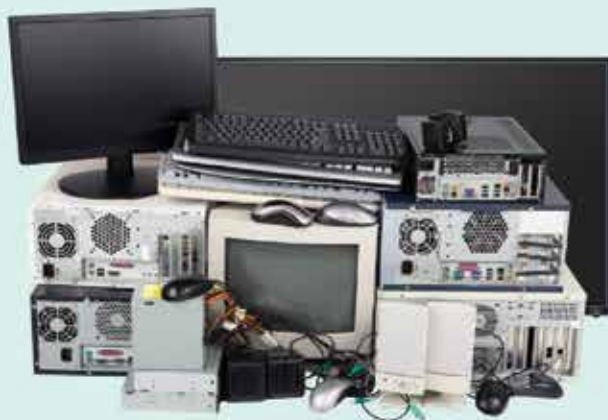
TVS AND COMPUTER EQUIPMENT