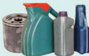
USED OIL, OIL FILTERS, EMPTY OIL CONTAINERS