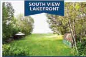
SOUTH VIEW LAKEFRONT

Cleared and Ready South Exposure, wonderful beach, 220 x 70 foot lot qualifies this property as the best available lakefront home on Lake Wabamun. Current owners Summer camped for years on lot, Get the pier ready.