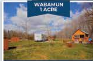
WABAMUN 1 ACRE

RV Friendly Pull your RV in and hookup to the 220 power. Plug your sewer line into the 1000 gallon holding tank and turn on your drilled well on a concrete pad. Great lake Access, time to get the boat in the water.