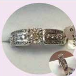
14K White Gold Diamond Ring Brand New, Still in Box, Tags on! Asking $3,245

For more information about the #Influencers event or to submit an online nomination, please visit Leduc.ca/influencers .