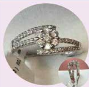
10K White Gold Diamond ring Brand New, Still in Box, Tags on! Asking $1,375

Call for more information, or to view the ring 780-907-8642