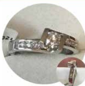
14K White Gold Engagement Ring Brand New, Still in Box, Tags on! Asking $2,800