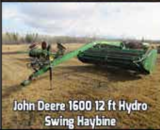
John Deere 1600 12 ft Hydro Swing Haybine