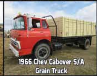
1966 Chev Cabover S/A Grain Truck