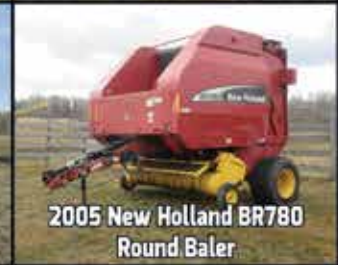
2005 New Holland BR780 Round Baler