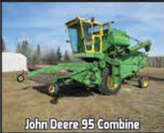
John Deere 95 Combine