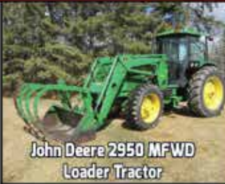
John Deere 2950 MFWD Loader Tractor

Directions: From Seba Beach go 1.5 kms north on Hwy 31 sale on right side of road. From Hwy 16 and Hwy 31 Intersection go approx 2 km south on Hwy 31. Full Listing @ www.teamauctions.com