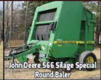
John Deere 566 Silage Special Round Baler