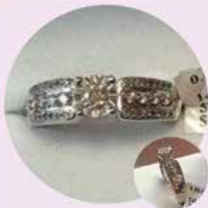
14K White Gold Diamond Ring Brand New, Still in Box, Tags on! Asking $3,245

The Adventure Guide can be picked up free of charge at the County office, libraries, schools and participating merchants.