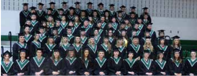
Submitted by Onoway Jr Sr High School

Last September, it seemed graduation day for OJSH Grade 12 students was still a far off dream with lots of time to determine courses, work on assignments, socialize with friends