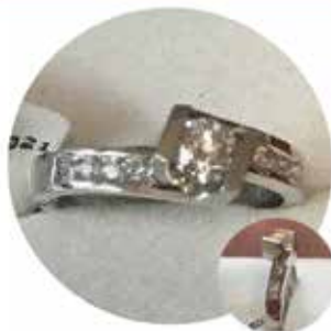
14K White Gold Engagement Ring Brand New, Still in Box, Tags on! Asking $2,800