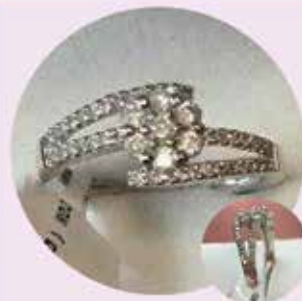
10K White Gold Diamond ring Brand New, Still in Box, Tags on! Asking $1,375

Call for more information, or to view the ring 780-907-8642