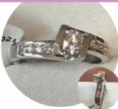
14K White Gold Engagement Ring Brand New, Still in Box, Tags on! Asking $2,300