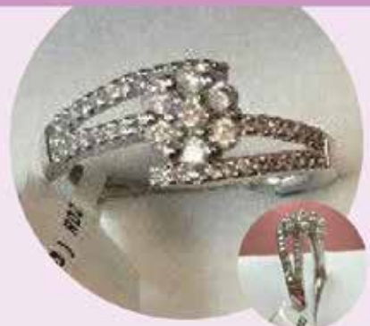
10K White Gold Diamond ring Brand New, Still in Box, Tags on! Asking $1,375

Call for more information, or to view the ring 780-907-8642