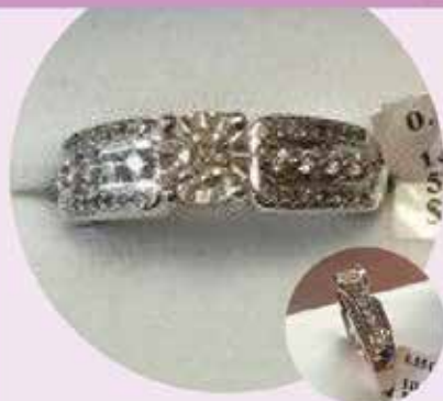
14K White Gold Diamond Ring Brand New, Still in Box, Tags on! Asking $2,745