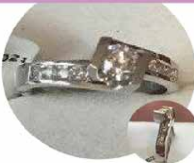
14K White Gold Engagement Ring Brand New, Still in Box, Tags on! Asking $2,300