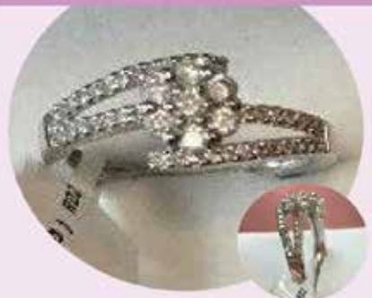
10K White Gold Diamond ring Brand New, Still in Box, Tags on! Asking $1,375

Call for more information, or to view the ring 780-907-8642