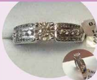
14K White Gold Diamond Ring Brand New, Still in Box, Tags on! Asking $2,745