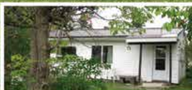
Affordable RECREATIONAL or Year Round Lake Home $124,900