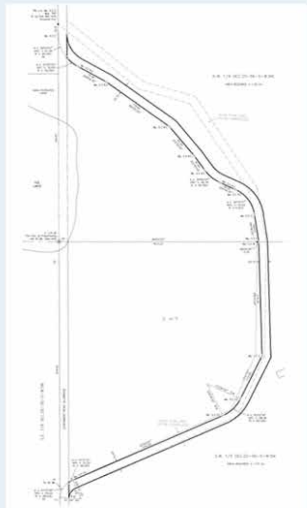
Figure 2: New Road Alignment