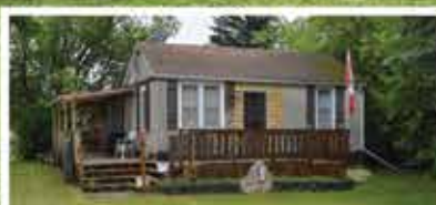
Cottage comforts in Yellowstone $118,000