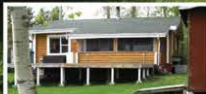
Log Home w/ Lake Views Yellowstone $244,900