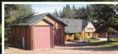
Lake front Cedar Log Home 5 Car Garage w/ RV bay $724,900