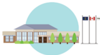
PARKLAND COUNTY CENTRE 53109A HWY 779, Parkland County, AB T7Z 1R

This means, even post-COVID, the County Services Building reception will no longer be accepting walk-in visitors.