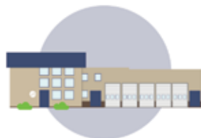
COUNTY SERVICE BUILDING 2700 48 St, Stony Plain, AB T7Z 2Y1

As of February 1, the Parkland County Centre will be the main point of contact for all your customer service needs. We remain closed for walk-in traffic due to COVID-19, so simply give us a call at 780-968-8888 and our team will be happy to answer any questions you may have or re-direct you to the best person to help!