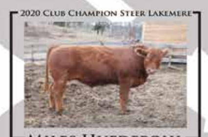
MILES HUEDEPOHL PURCHASED BY BING'S #1