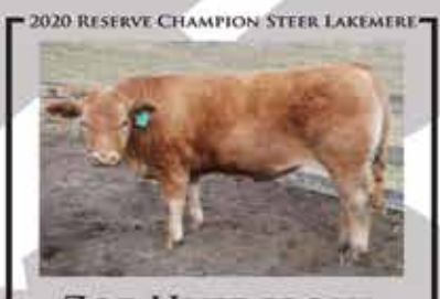
ZOE HUEDEPOHL PURCHASED BY KINDRED ORCHARDS