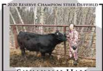
SAVANNAH HALL PURCHASED BY WEST PARKLAND GAS CO-OP LTD.