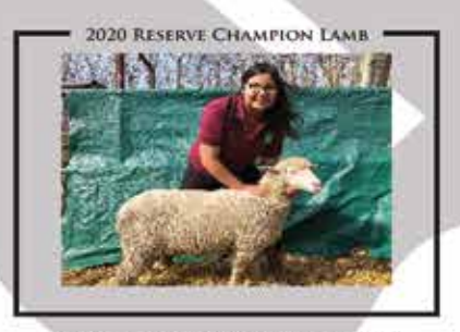
PURCHASED BY SKY BLUE FARM