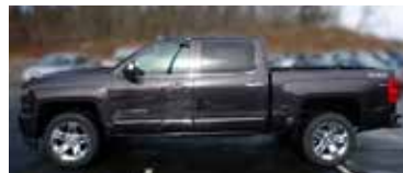
Continued from Page 1

Leduc RCMP is still looking to speak with the driver of the truck to confirm their wellbeing. The truck is described as a dark grey Chevrolet Silverado 1500, model LTZ Z71 (example photo shown). The suspect