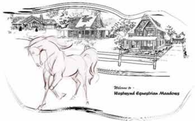
Welcome to Westwynd Equestrian Meadows