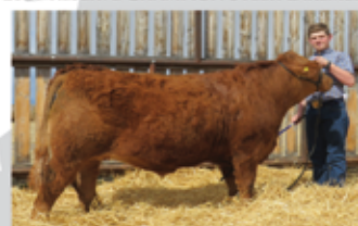
CARTER BOWMAN PURCHASED BY PARKLAND FARM EQUIPMENT