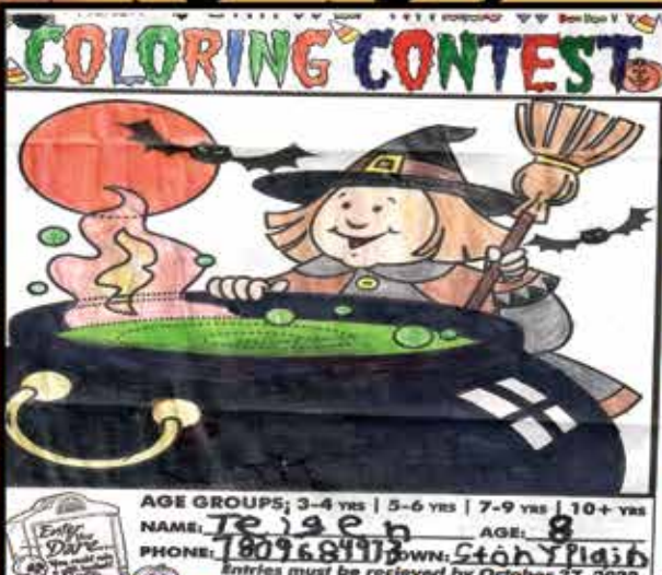
Teigen. Age 8