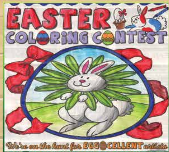
Ava-re Y. Age 10