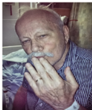
"Paratroopers Never Die, They Just Drift Away"

These investments in modulars and school planning are all part of the province's Schools Now program, which includes a generational investment of $8.6 billion to build and update more than 100 schools across the province and create more classroom spaces now. Over seven years, Schools Now will create more than 200,000 student spaces, helping school boards manage class sizes and bringing learning closer to home for more Alberta students and families.