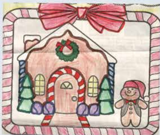
Skyla Age 9