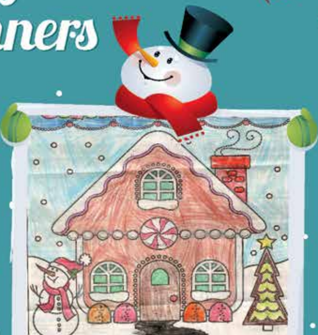
Viola. Age 7