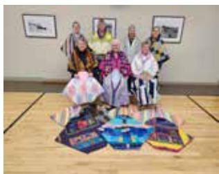
Submitted by Seba Seniors

Each year, our Seba Seniors Quilting group spends one day a month creating beautiful handmade items to give to those in need. Last year, they donated 13 quilts to Little Warriors—an incredible gift made with love.